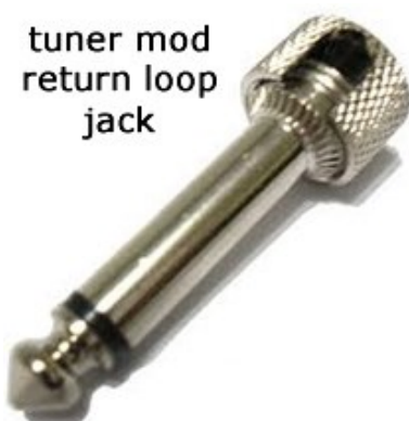
tuner mod return loop jack